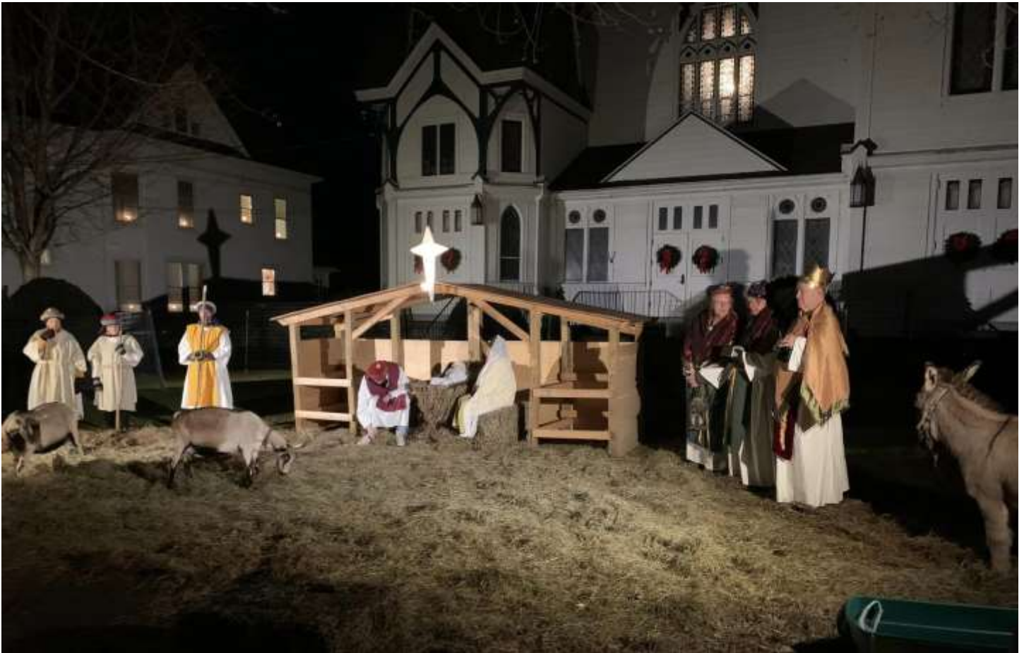
~ Living Nativity ~